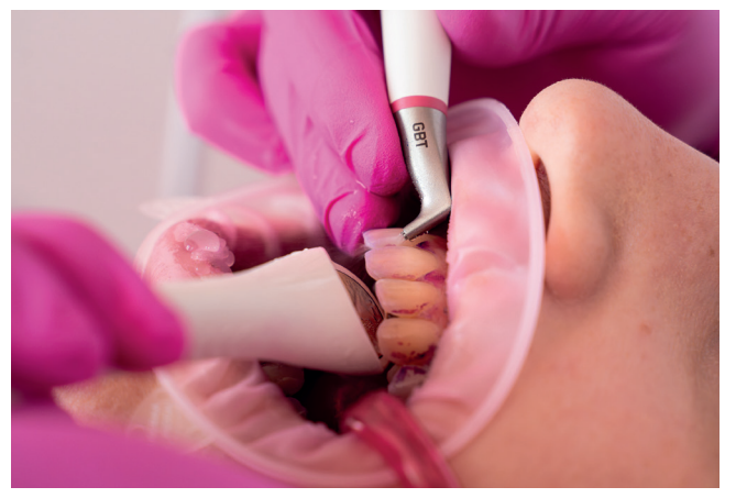
Fig. 2: State-of-the-art prevention with AIR-FLOWING®: This effective yet gentle method is ideal for managing biofilm on all oral tissues, including implants and restorations.