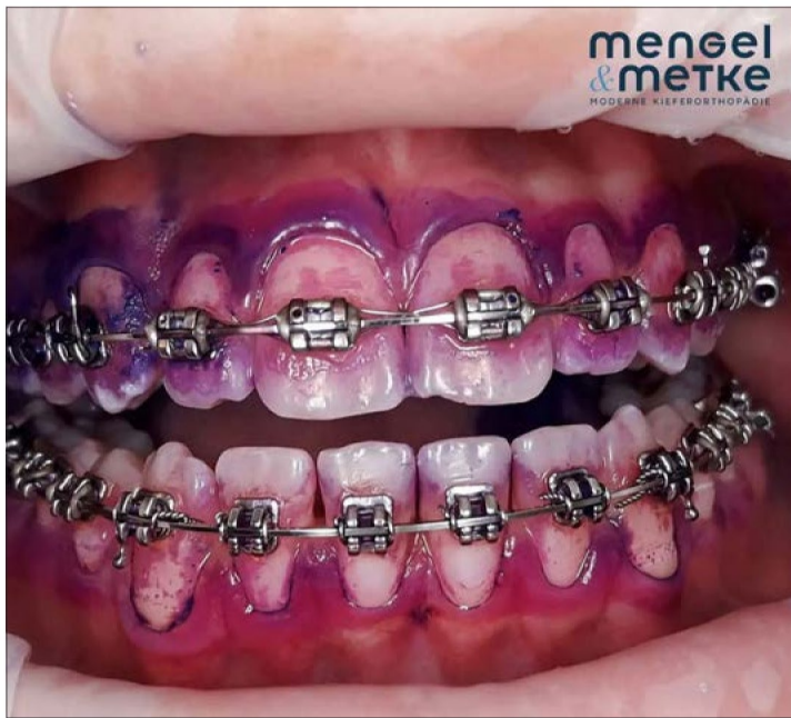
Guided Biofilm Therapy in the orthodontic practice: Situation after disclosure ...

According to a recent survey by the German Oral Hygiene Foundation (DMS 6), about 40.5 percent of children in Germany need orthodontic treatment [6], although not all of these children need to be treated with fixed appliances. But the significance of the problem is already apparent in light of the high numbers needing treatment and the high prevalence of WSL.