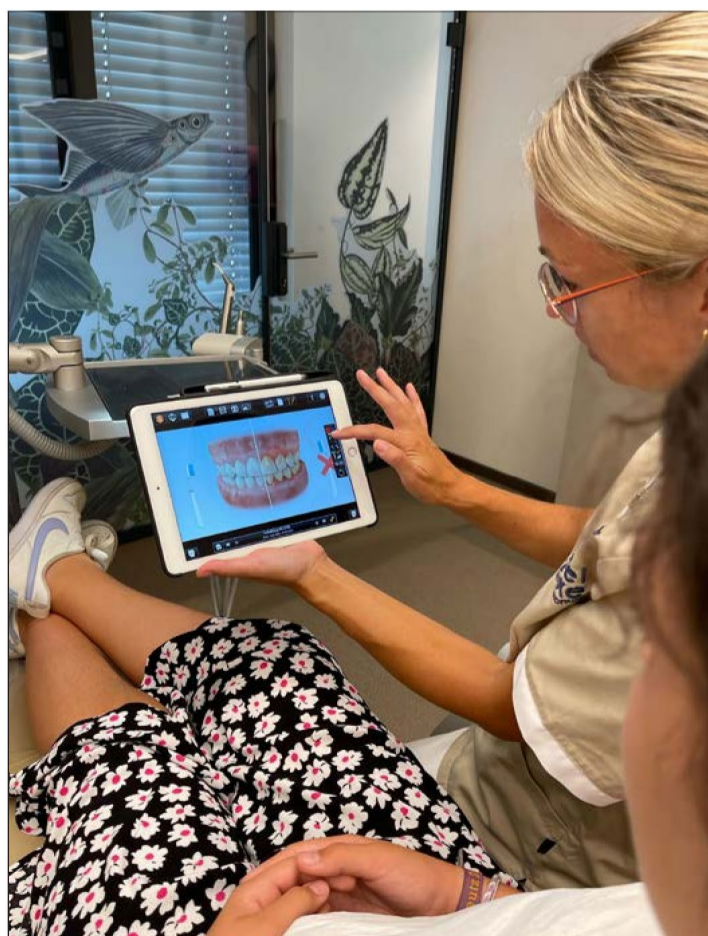
At the first checkup she discusses with the patient whether they could implement the tips for homecare and how they went with handling the cleaning brushes.