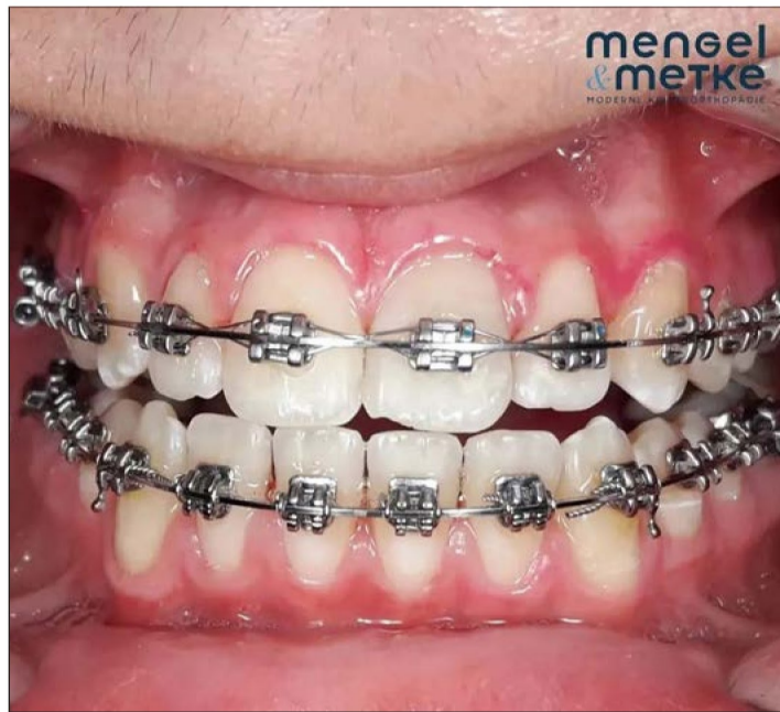
... and after treatment with the AIRFLOW® Prophyllaxis Master and Plus Powder from EMS.

Previously, preventive treatment was always performed when the arch wire was changed and probably also needed more time. Using the AIRFLOW® Handpiece and Plus Powder enables the area between the bracket and the sulcus to be cleaned thoroughly, even if the gingiva is swollen. It is difficult to reach this area using brushes and it is very unpleasant if you need to work very close to the gingiva with the brushes. I would also say that we were not always able to remove hundred percent of the biofilm in the brackets using brushes. That was more often the case with ceramic brackets. We could remove the plaque completely with the Airflow . The cleaning effect is better and it is much more pleasant for the patients.