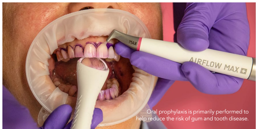
Oral prophylaxis is primarily performed to help reduce the risk of gum and tooth disease.

There are many air-polishing devices on the market but it is important to know whether they can fulfil GBT's minimally invasive approach. Factors including powder choice and powder delivery to the tooth surface are important when considering the right device for treatment. Knowing the quantity of powder delivered to the tooth is not only important for efficient cleaning but also for minimising tooth abrasion and over-treatment. However, there is a lack of insight into exact powder delivery behaviour of different air-polishing devices. A collaborative team of scientists and researchers from Switzerland including Dr Marcel Donnet, Dr Maxime Fournier, Professor Patrick Schmidlin, and Professor